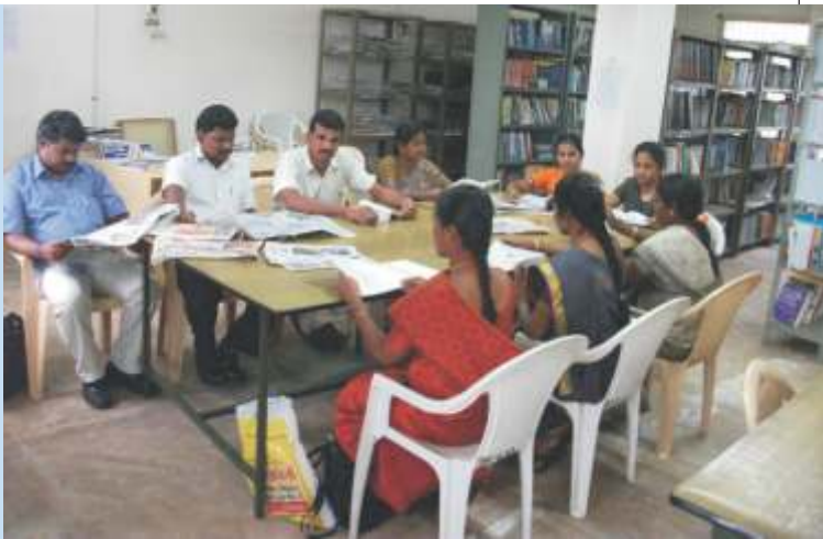
B.Ed., Library, SDE, Bharathiar University

The Entrance Examination will be conducted during March and the exact date will be informed latter. Hall tickets will be issued ten days prior to the date of entrance test. Only those candidates who have satisfied the eligibility condition will be allowed to appear for the Entrance Test. Entrance Test can be written in English or Tamil, However, appearing for the Entrance Test will not guarantee admission to the B.Ed. programme.