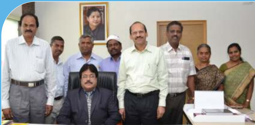
FACULTY MEMBERS WITH VICE CHANCELLOR, REGISTRAR & DIRECTOR