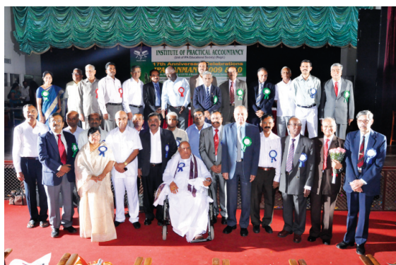
IPA SANMAN 2009-10

Academic Schedule will be supplied to the candidates at the time of admission